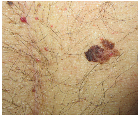
Figure 2 Melanoma diagnosed 4 months after a solid organ transplant, located just a few centimeters from the laparotomy scar, highlighting the importance of a full dermatologic examination before the procedure.

of melanoma in 7 donors whose organs were provided to 44 recipients. 6 Thirty-five recipients (80%) developed melanoma within 3 to 24 months of the transplant, and 33 (75%) died as a result. 6,11 These data indicate that anyone with a history of melanoma should not be ruled out as an organ donor. In addition, potential donors should be given a full-body examination to search for lesions or scars suspicious for melanoma. 3,4